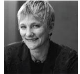
Dr. Anita Borg (1949-2003)

Dr. Anita Borg devoted her adult life to revolutionizing the way we think about technology and dismantling barriers that keep women and minorities from entering computing and technology fields. Her combination of technical expertise and fearless vision continues to inspire and motivate countless women to become active participants and leaders in creating technology. In her honor, Google is proud to honor Anita's memory and support women in technology with the Google Anita Borg Memorial Scholarship. Google hopes to encourage women to excel in computing and technology and become active role models and leaders in the field.